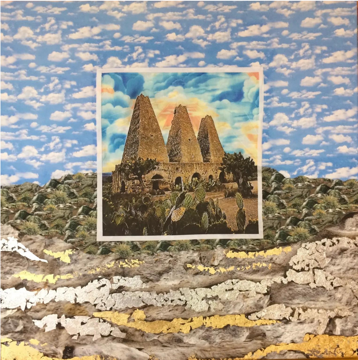
Beverly Sky, Ventana Al Pasado: A Window Into Gold & Silver Mining in Mexico 1810, Fabric Collage on canvas, 36" x 36"