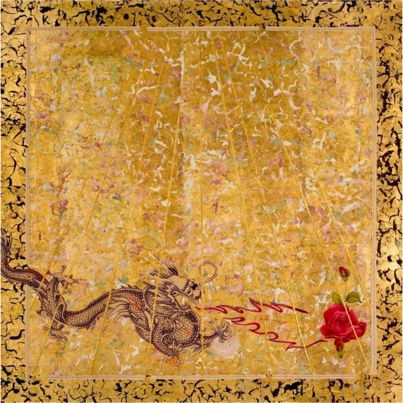
Beverly Sky, Amore y Morte: Sharing the Same Root, Fabric Collage on canvas, 36" x 36"