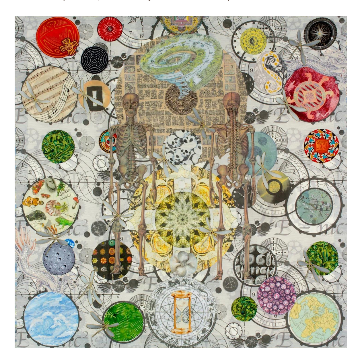
Beverly Sky, Evolution: The Sands of Time, Fabric Collage on canvas, 36" x 36"

My work as a fiber artist began with weaving large tapestries and evolved into papermaking / pulp painting and now, fabric collage. The landscapes that I created in handmade paper (HMP) were emotional and atmospheric whereas currently, my work in fabric collage tends to be idea or narrative based. In fabric collage, I use the intrinsic qualities of fabrics, colors, patterns, textures and images as a painting medium to express philosophical and spiritual concerns. My connection with nature is expressed in the relationship between material and content. I use pulp or cellulose, the fundamental structure of plant life, to create my own worldview of places I know and love.