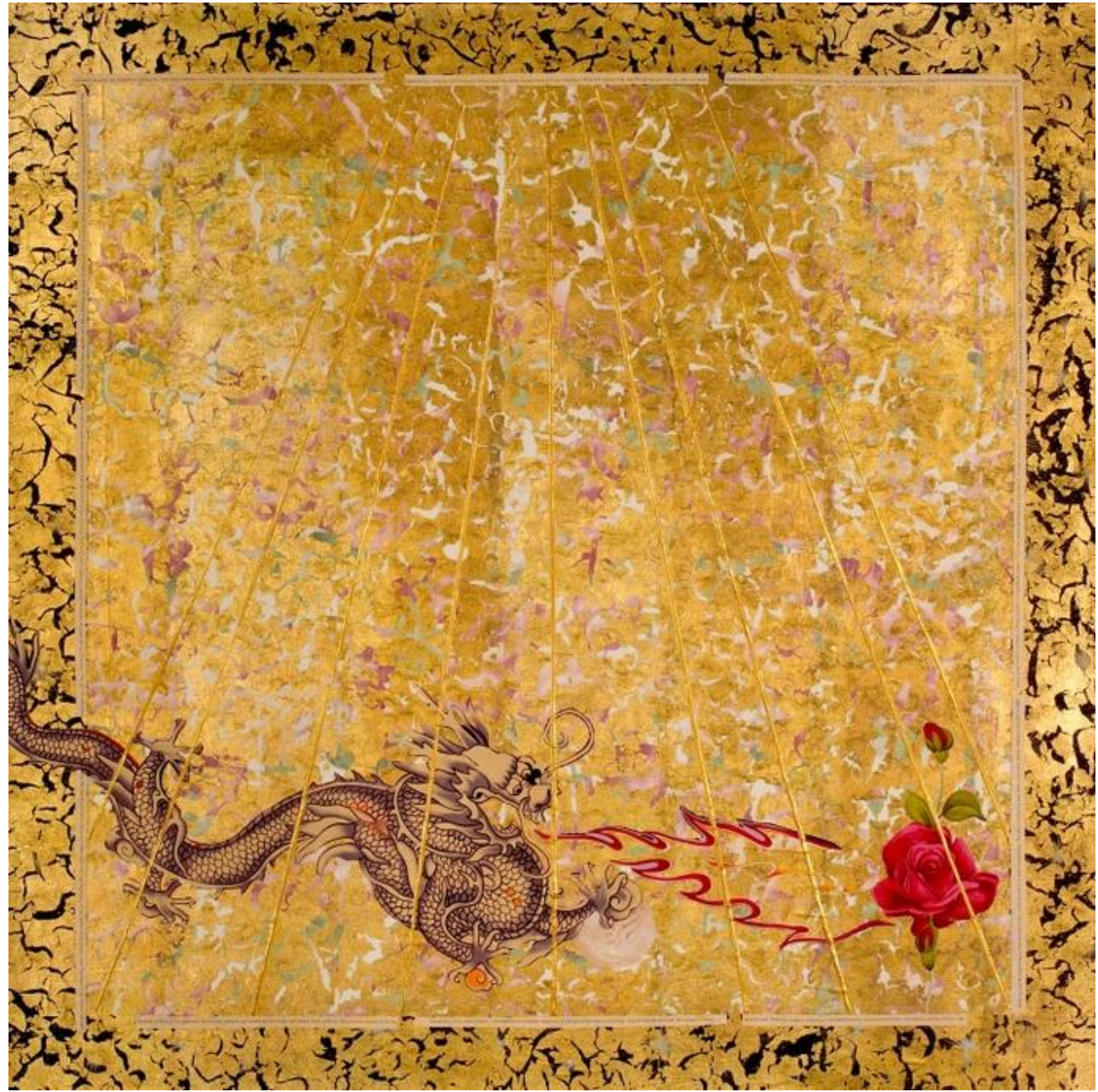
Beverly Sky, Amore y Morte: Sharing the Same Root, Fabric Collage on canvas, 36" x 36"