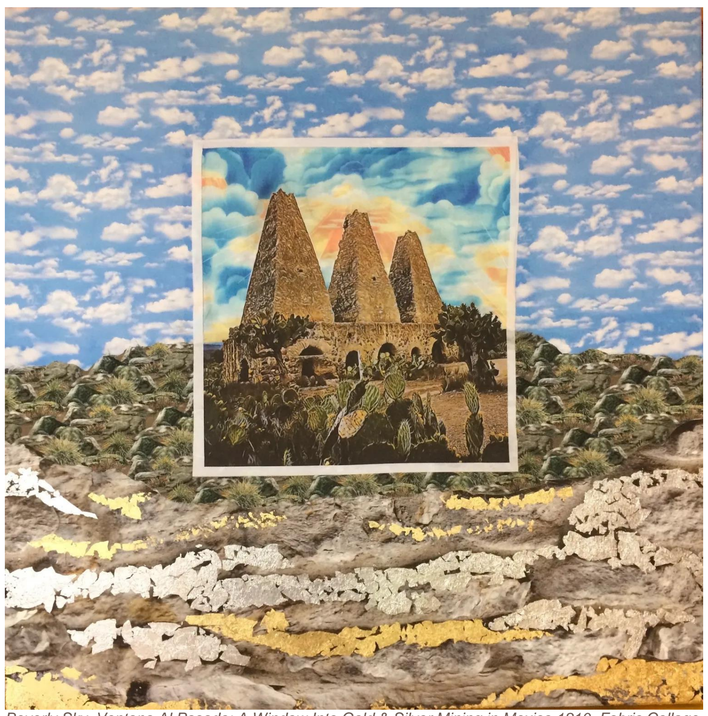
Beverly Sky, Ventana Al Pasado: A Window Into Gold & Silver Mining in Mexico 1810, Fabric Collage on canvas, 36" x 36"